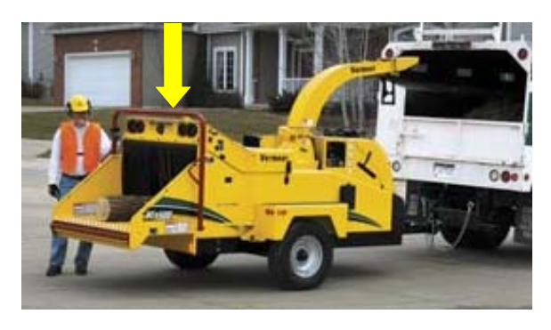
Feed control bar (in red) on top and sides with handles.

Feed Control Bar – Many chippers in use today have mechanical feed control bars that meet the ANSI Z133.1 requirement to include emergency stop devices. Pushing the feed control bar to the center (neutral position) stops the feed rollers, and pushing it toward the discharge spout reverses the feed rollers.