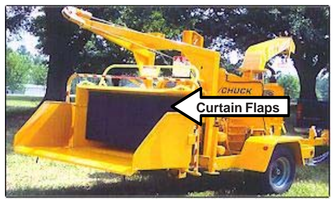
Flexible Rubber Curtain/Flaps

Discharge Spout Deflector/Guard – This device reduces the risk of being struck by flying debris. It redirects the discharge of wood chips into a chipper truck or in a safe direction away from employees.